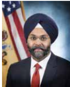
New Jersey Attorney General Gurbir S. Grewal

The manifesto thus seems to have zero objective of doing anything which could operate to deter or prevent crimes committed by illegal aliens from happening in the first place. This is the same stupid excuse coughed up by all Democrat-headed states and municipalities to promote lawlessness and justify handcuffing law enforcement personnel in order to frustrate ICE.